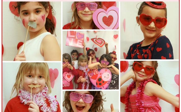
Lynn Fripps Sweetheart Sock Hop 2015